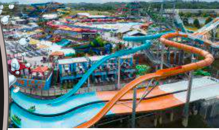
The Edge Dueling Watercoaster at Soaky Mountain Waterpark.

STAFF RETENTION PROGRAMS OR IN-SERVICE PROGRAMS: FAMILY COMPETITION STYLE 2 HOUR INSERVICE IN THE SLOW SEASON, BEAD PROGRAM IN THE SUMMER, DIVE-IN MOVIES, AND FLOWRIDER COMPETITIONS FOR THE GUARDS.